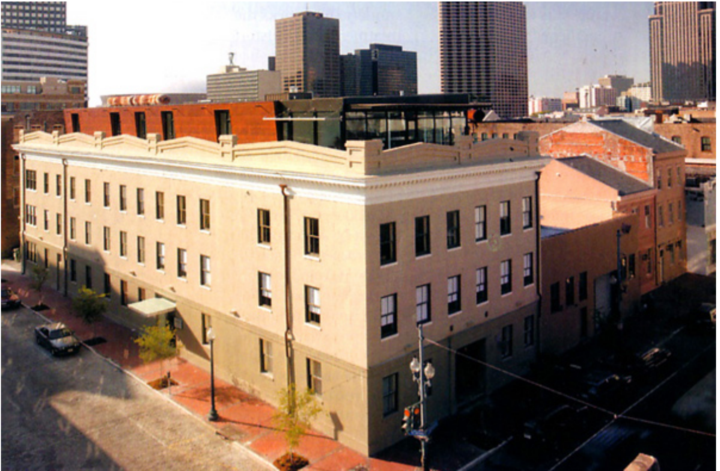
bird's eye view with penthouse

Originally townhouses, then an auto dealership, and later an office building, the structure at 861 Carondelet has experienced substantial modification. With the St. Joseph Condominiums, the historic, three-story townhouses are respectfully renovated and two new structures are introduced. The combined task of renovation and new construction offered the challenge of maintaining the historical integrity of an existing structure while contributing to the richness of the architectural fabric of the city.